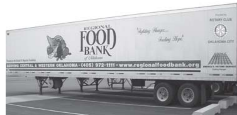
2006 Annual Project: Food Bank distribution trailers