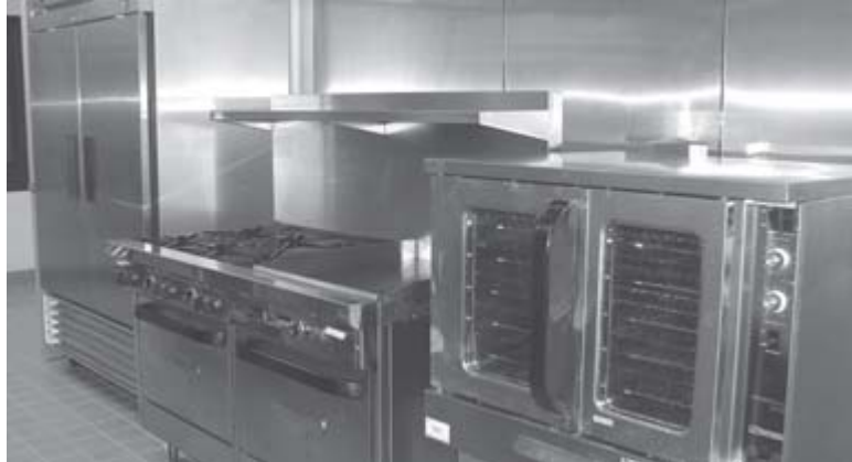
Kitchen - Boys & Girls Club 2003 Rotary Project $48,500